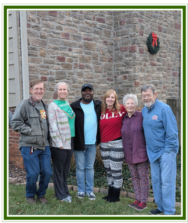
Greetings from our family to yours!